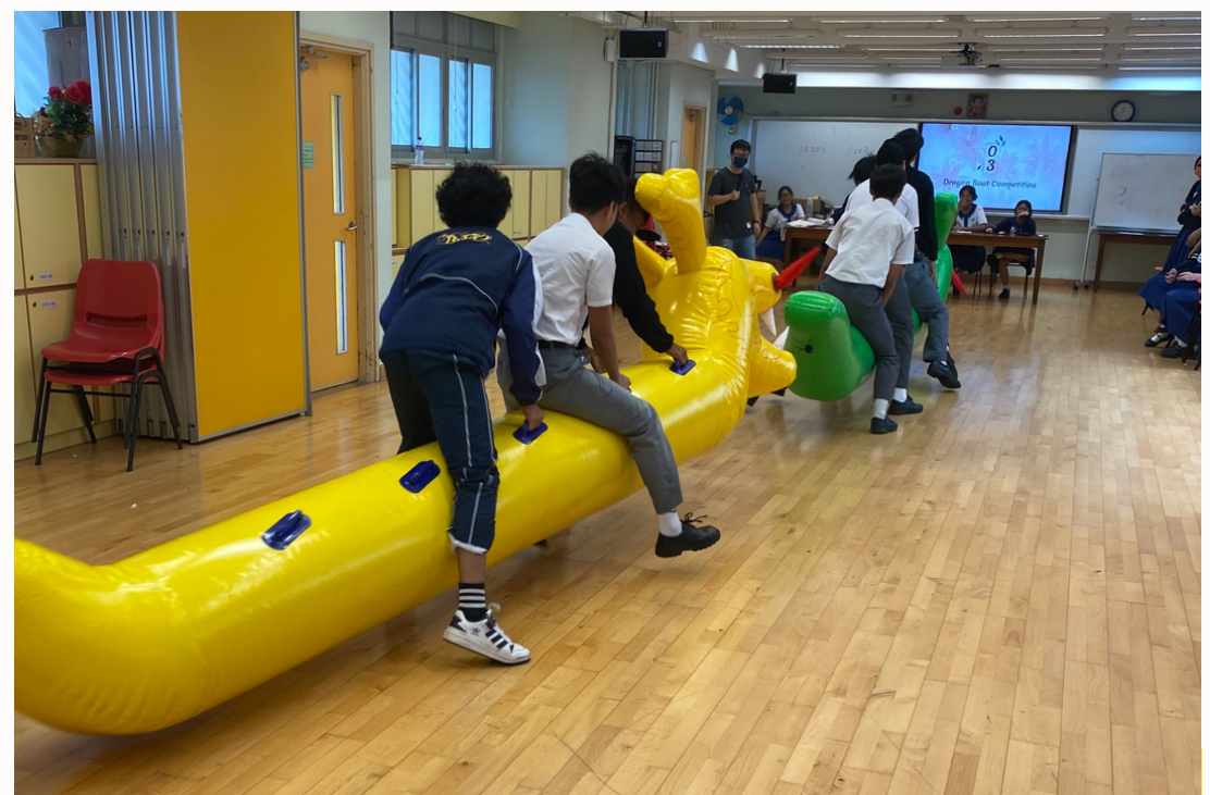
Oh! The yellow dragon was trying their best to catch up before the finishing line.

In collaboration with the Neighbourhood Advice-Action Council, our school has arranged a series of Festival Carnivals to spread the festive atmosphere around the campus and wrapped up the series with the Dragon-Boat Festival. Students not only learned about the traditional food and activities, but also had a taste of the dragon boat race. We hope all students can embrace cultures that are different from their own.