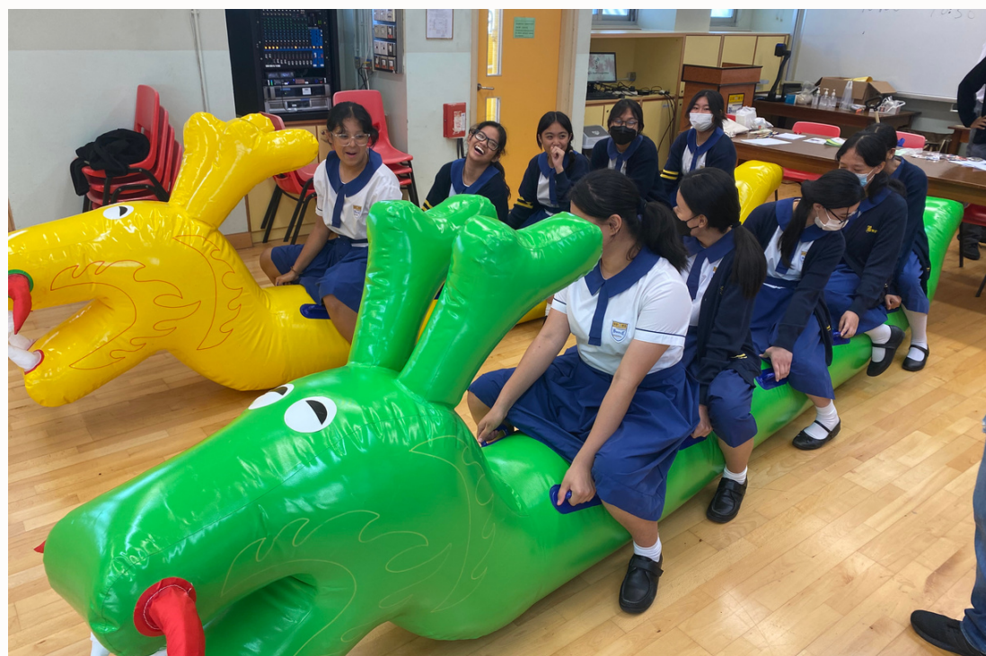
The girls are ready for the race! They look excited sitting on the dragon boat!