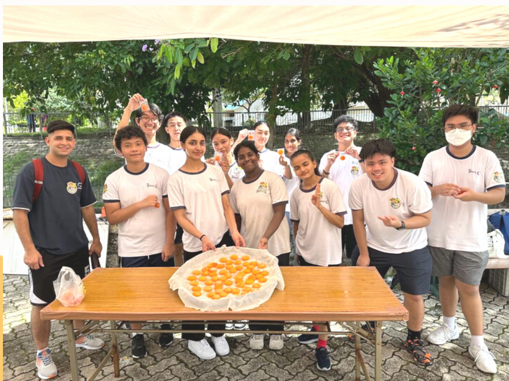
It was the first time our NCS students made the Sun-baked salted eggs. Hope they enjoy the eggs at home:)

To promote the local culture and history of Hong Kong outside the classroom, the Joyful Learning Group organized a tour to the Tai O Fishing Village, also known as the Venice of Hong Kong.