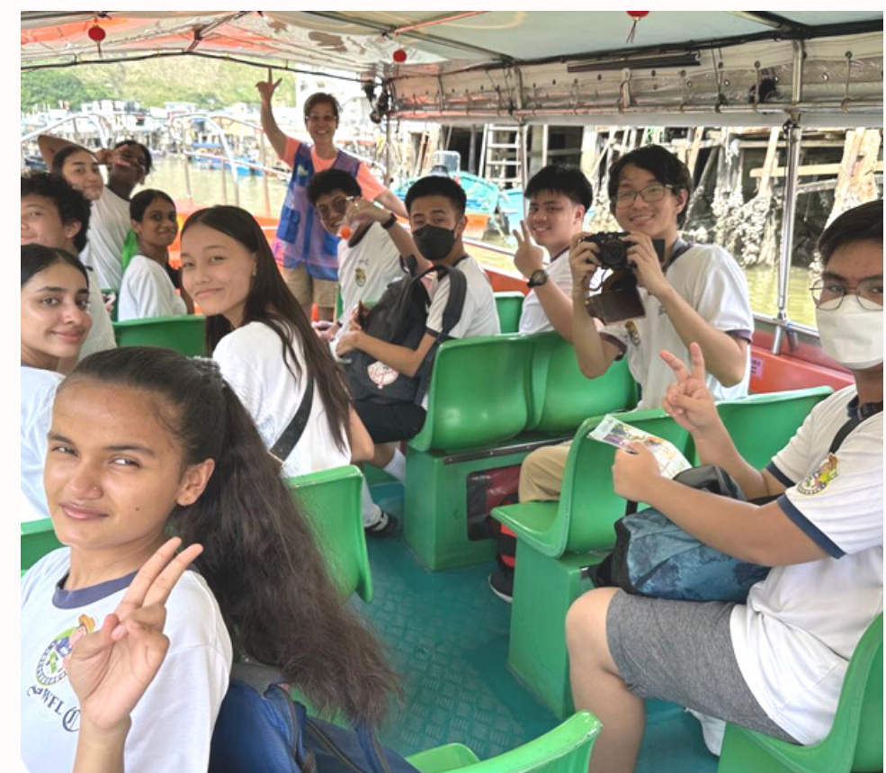
Let's embark on the boat ride to find white dolphin!

They visited the stilt house, got on a boat ride and made salted eggs and fishing nets. Let's look at some of the highlights of the day.